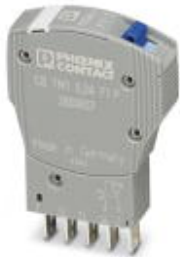
Thermomagnetic device circuit breaker, 1-pos., tripping characteristic F1 (fast-blow), 1 PDT contact, plug for base element.

Please be informed that the data shown in this PDF Document is generated from our Online Catalog. Please find the complete data in the user's documentation. Our General Terms of Use for Downloads are valid ( http://download.phoenixcontact.com )